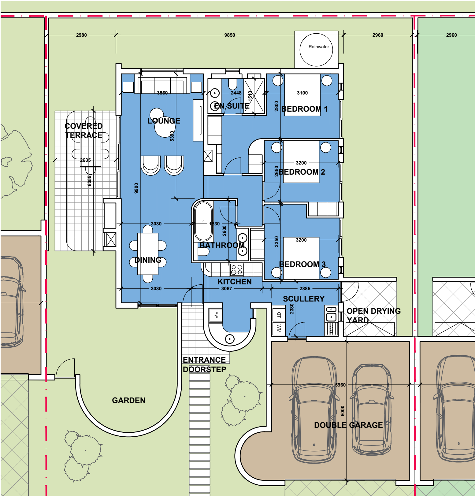
Ground Floor Plan (Scale 1:100 @ A3)