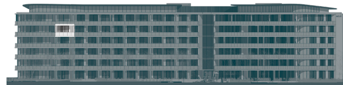
Sea facing elevation