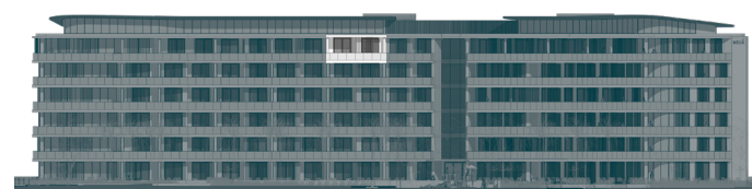
Sea facing elevation