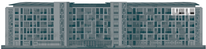
Mountain facing elevation