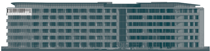
Sea facing elevation