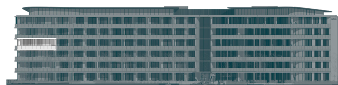
Sea facing elevation