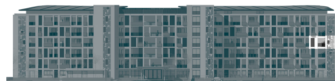
Mountain facing elevation