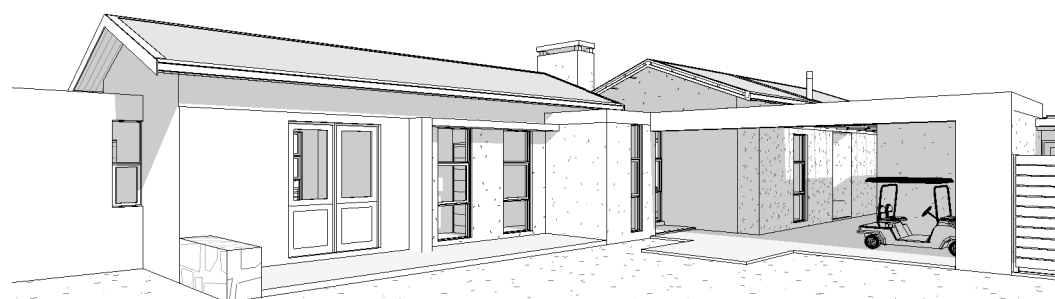
3D - PERSPECTIVE VIEW 1 SCALE: N.T.S