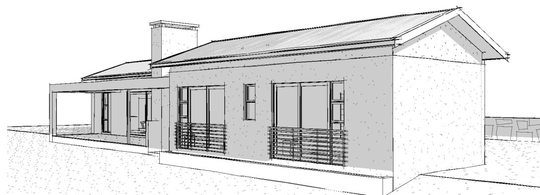
3D - PERSPECTIVE VIEW 2 SCALE: N.T.S