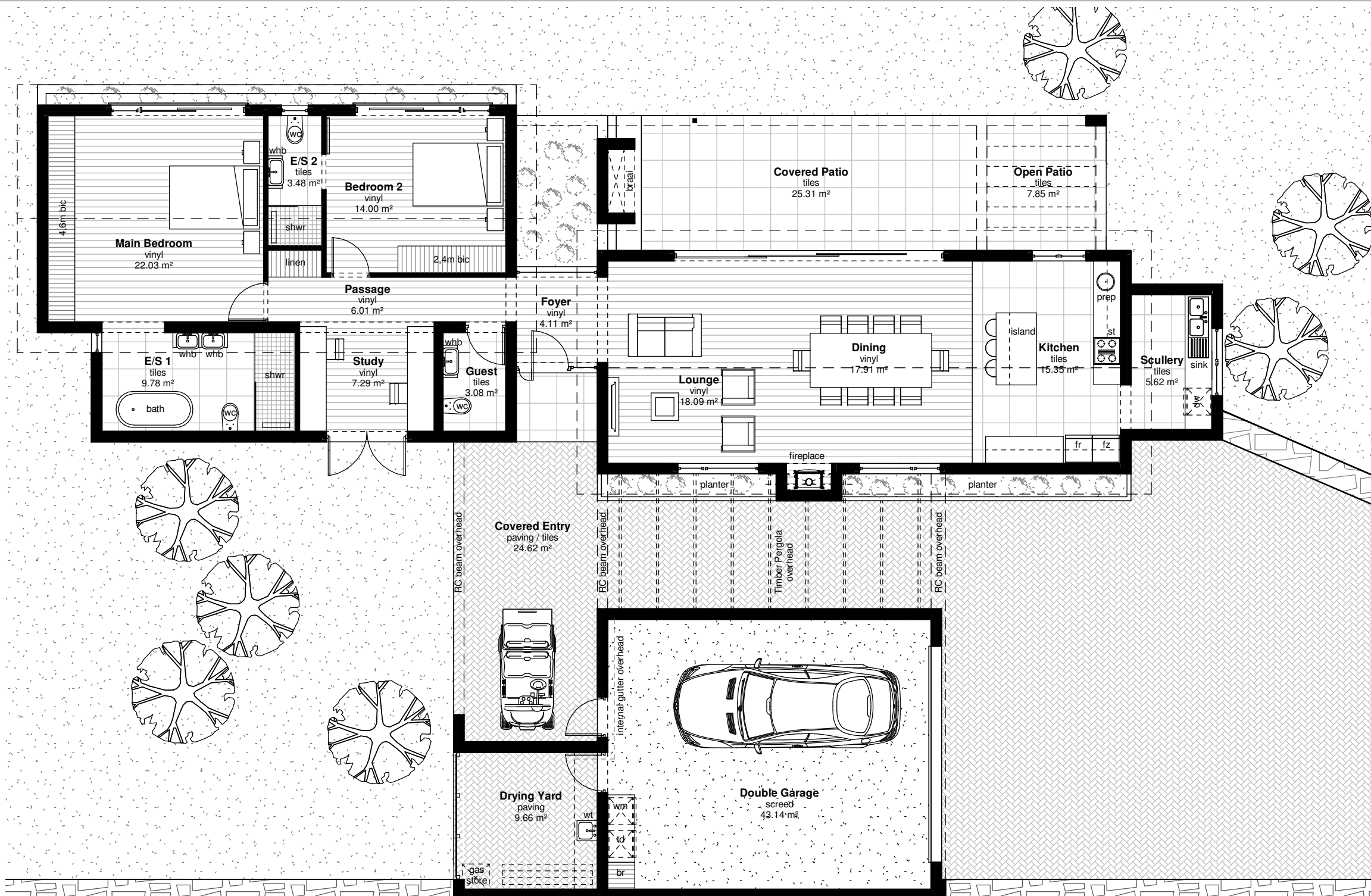
GROUND FLOOR PLAN SCALE: 1:100